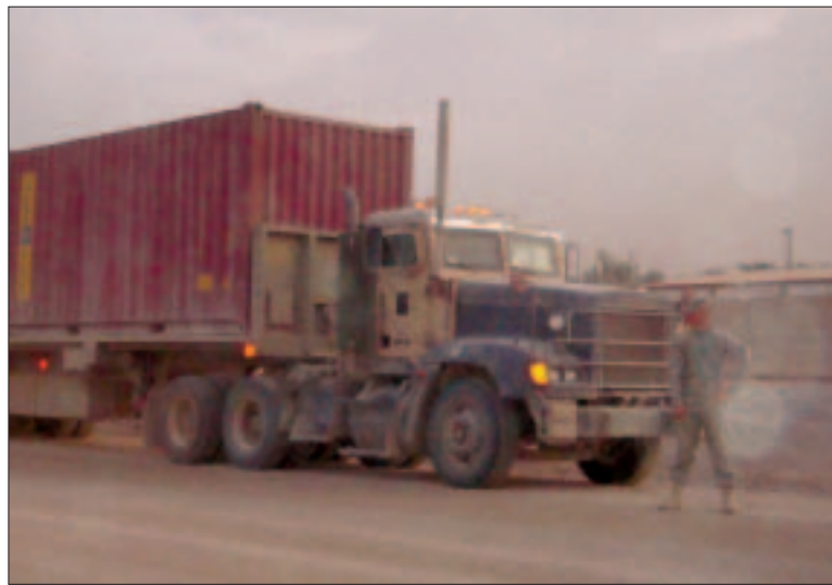
Soldiers of the 3-68th Trans. Det. set out to deliver equipment to coalition troops in support of Multi National Division-Baghdad. The Vicenza and Mannheim based troops are in Iraq on a 15 month deployment.

To date, the 3-68th conducted over 150 successful deliberate