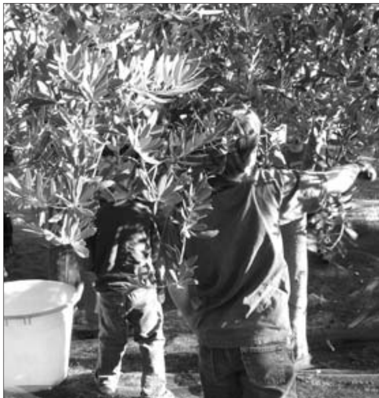
All the hard - but fun - work of picking olives is already done. Now learn how to use the pressings to make delicious Italian dishes, from starters to dessert with ITR's Cooking with Olive Oil class Jan. 21. Call 634-7094 for details

Looking for the movie synopsis? Check out the AAFES Web site: www.aafes.com , scroll to the bottom of the page and click on Movie Schedule.