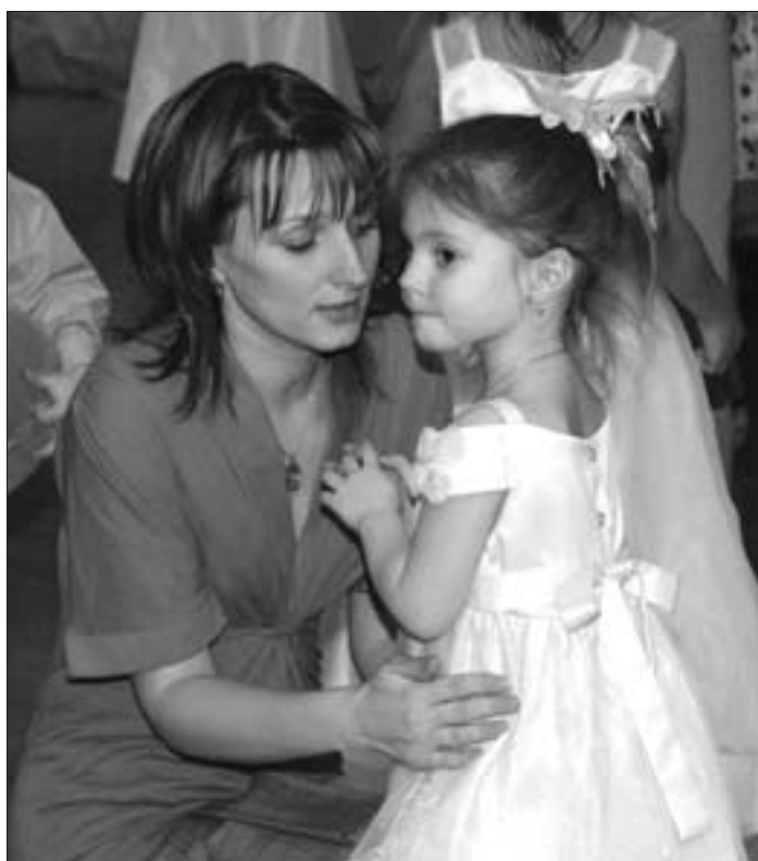
A mother and her daughter get ready to hit the dance floor at last year's Parent and Child Dance.

Vicenza American schools are closed Jan. 19 to celebrate Martin Luther King Jr. holiday and Jan. 23 for a teacher work day.