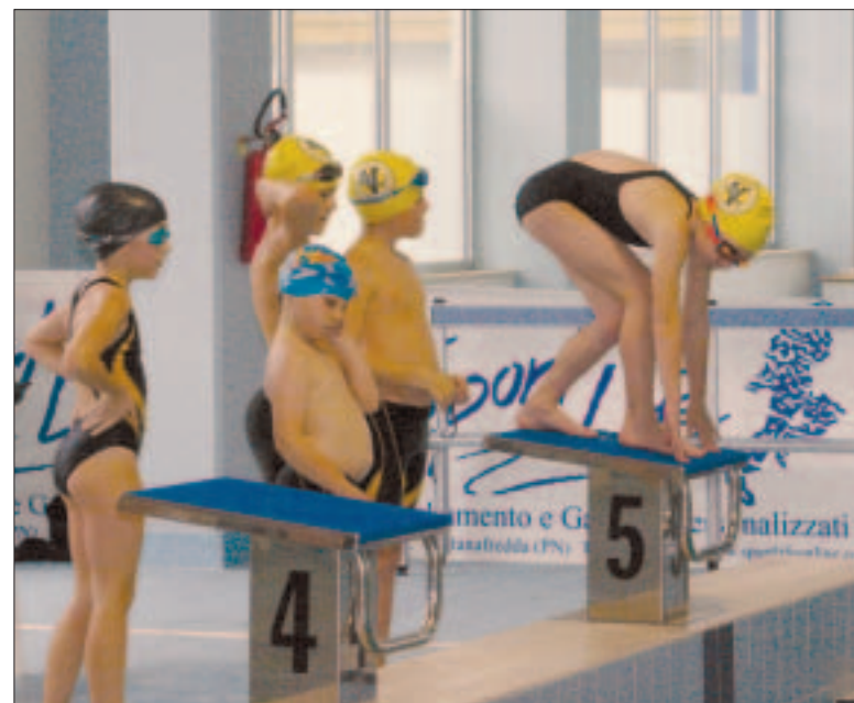
Mako Sharks get set on their starting blocks prior to their individual heats.